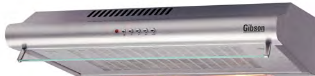
GHU2T635MS / GHU2T625MS