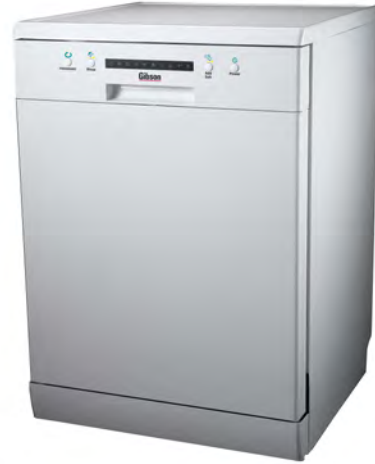
12 Place Setting Model Shown

Gibson freestanding dishwasher model GDFD09JFC can conveniently wash 9 place settings of your dinnerware with one of six wash programs. The half load option is perfect for washing six or fewer place settings.