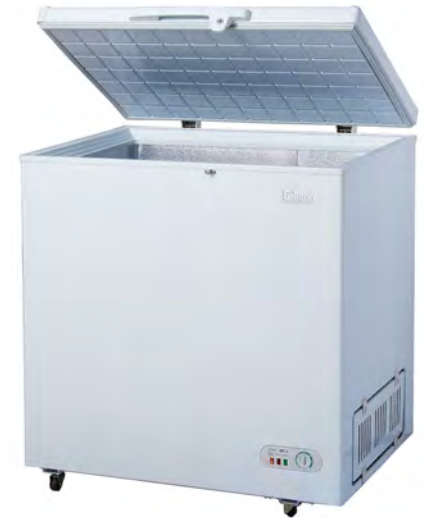
218 Liter and 178 Liter Models