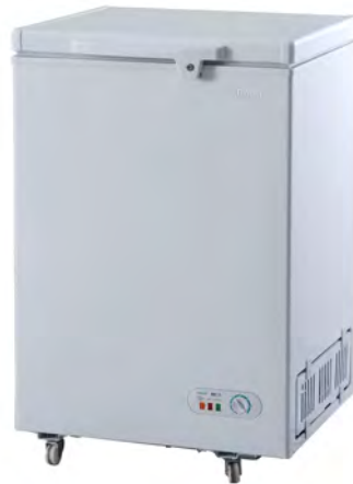
128 Liter and 108 Liter Models

For maximum frozen food storage, invest in a Gibson mid-sized or compact chest freezer. Models range in size from 349 liters to 112 liters.