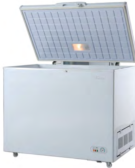
338 Liter and 298 Liter Models

Gibson is a registered trademark © Electrolux Home Products, Inc. 2012 G12FF-GFBR34GFAWJR+-A